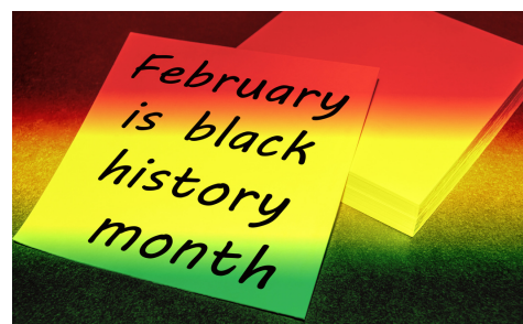
Page 2 - Rise in CTE Infographic

"Darkness cannot drive out darkness, only light can do that." ~ Martin Luther King Jr.